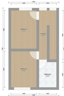
St Stephens First Floor