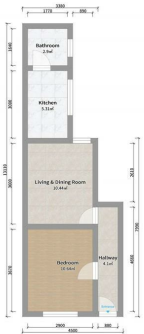
St Stephens Ground Floor